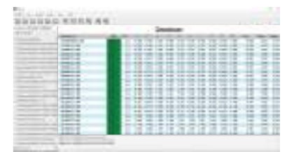
Data Optimization and Output