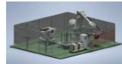
Product and Solution Management